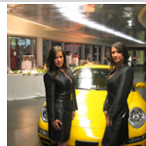
Hostesses in leather outfits trimmed with alligator posed in the Downtown Porsche dealership at the launch of the Porsche Cayman S .