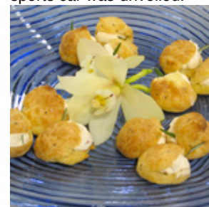
Eatertainment Special Events & Catering served profiteroles filled with goat