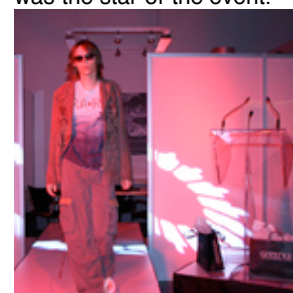
Got Style put on a fashion show shortly before the sports car was unveiled.