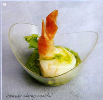
Nouveau shrimp cocktail