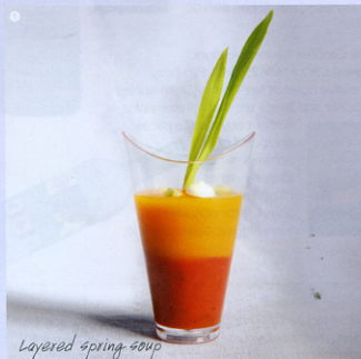
Layered spring soup