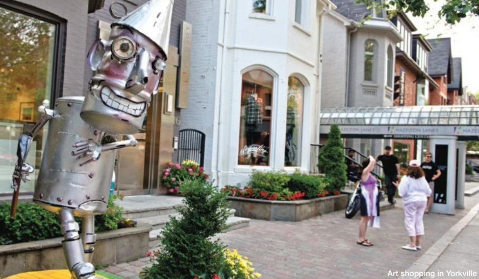
Art shopping in Yorkville