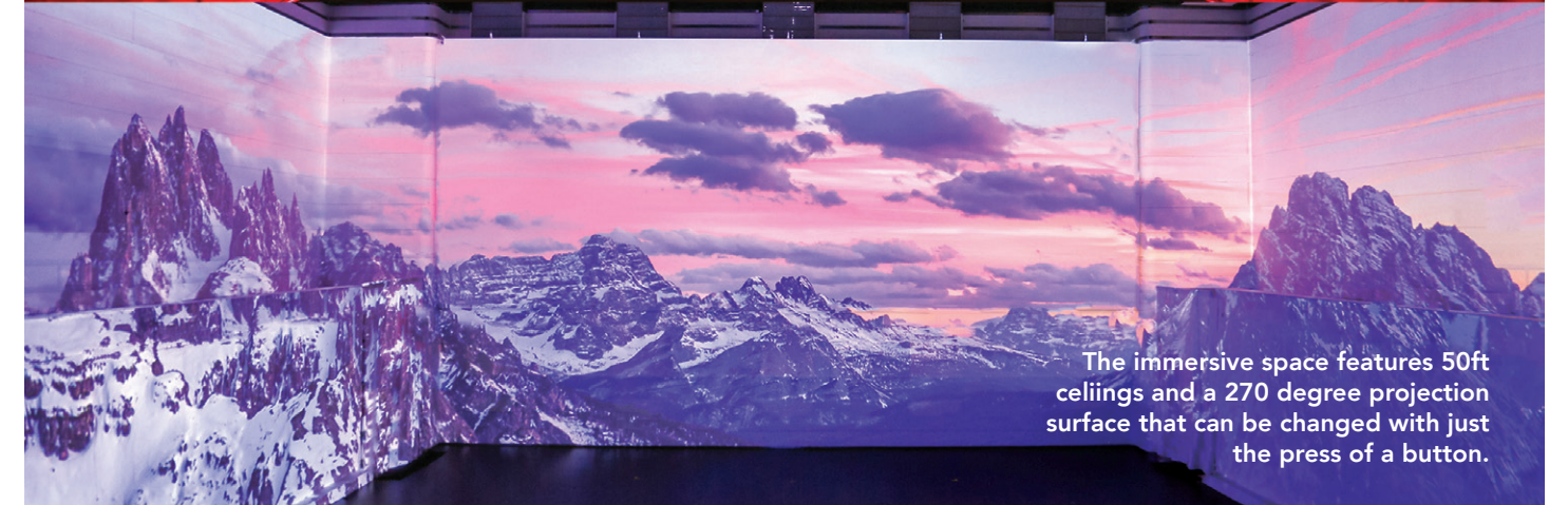
The immersive space features 50ft ceilings and a 270 degree projection surface that can be changed with just the press of a button.

unique and the type events the space is now best suited to host?