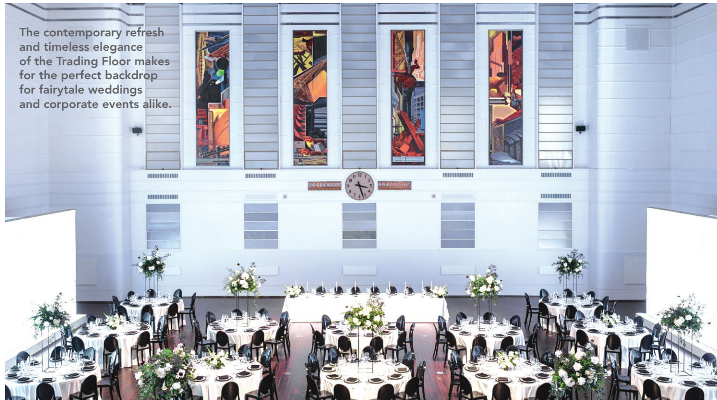
The contemporary refresh and timeless elegance of the Trading Floor makes for the perfect backdrop for fairytale weddings and corporate events alike.